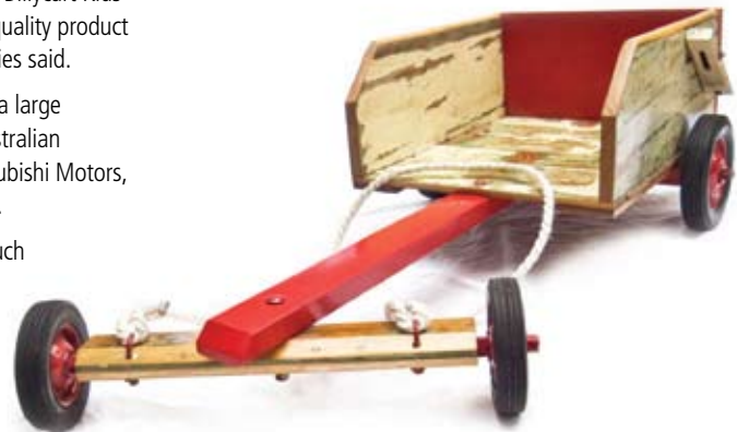
• Visit www.billycartkids.com