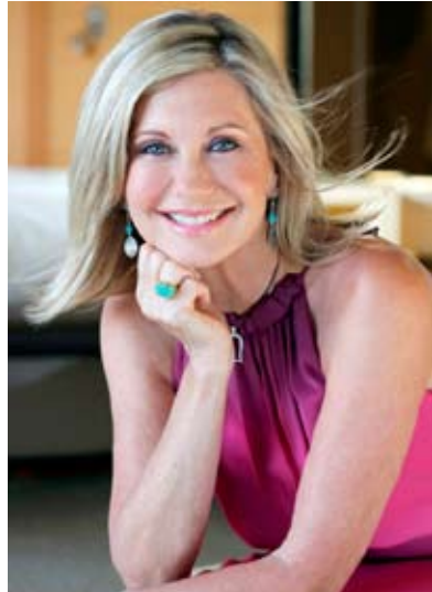
Olivia Newton John

These people have been very kind and generous in their donations for Orana and we would like to thank them very much for their support.