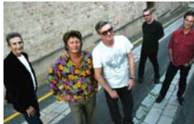
Mental as Anything