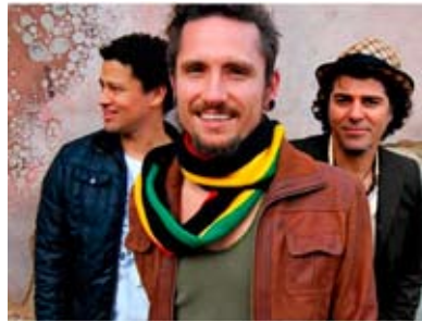
John Butler Trio