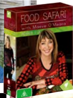
Food Safari (SBS) with Maeve O'Meara