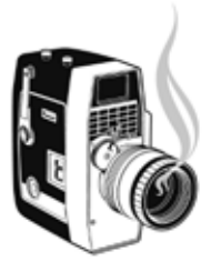
Zapruder's other films