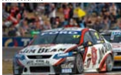
Jim Beam Racing