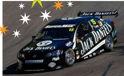
Jack Daniels Racing Team – Todd & Rick Kelly