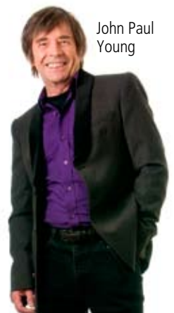
John Paul Young